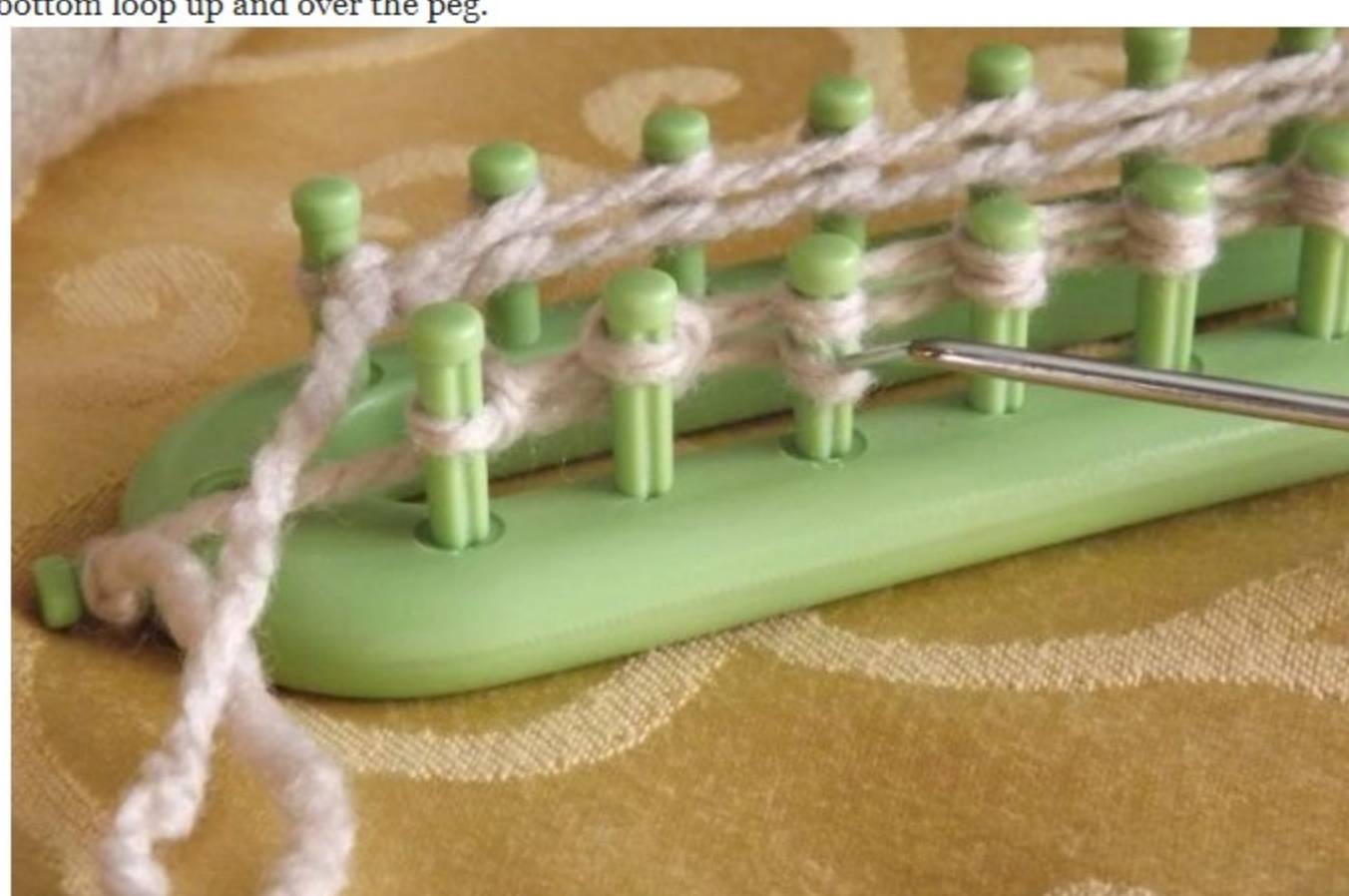
Complete the stitch.