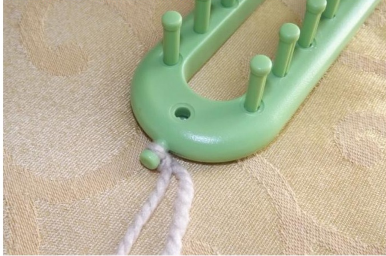
Slipknot to anchor peg.