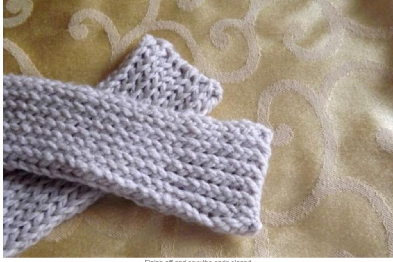
Finish off and sew the ends closed.