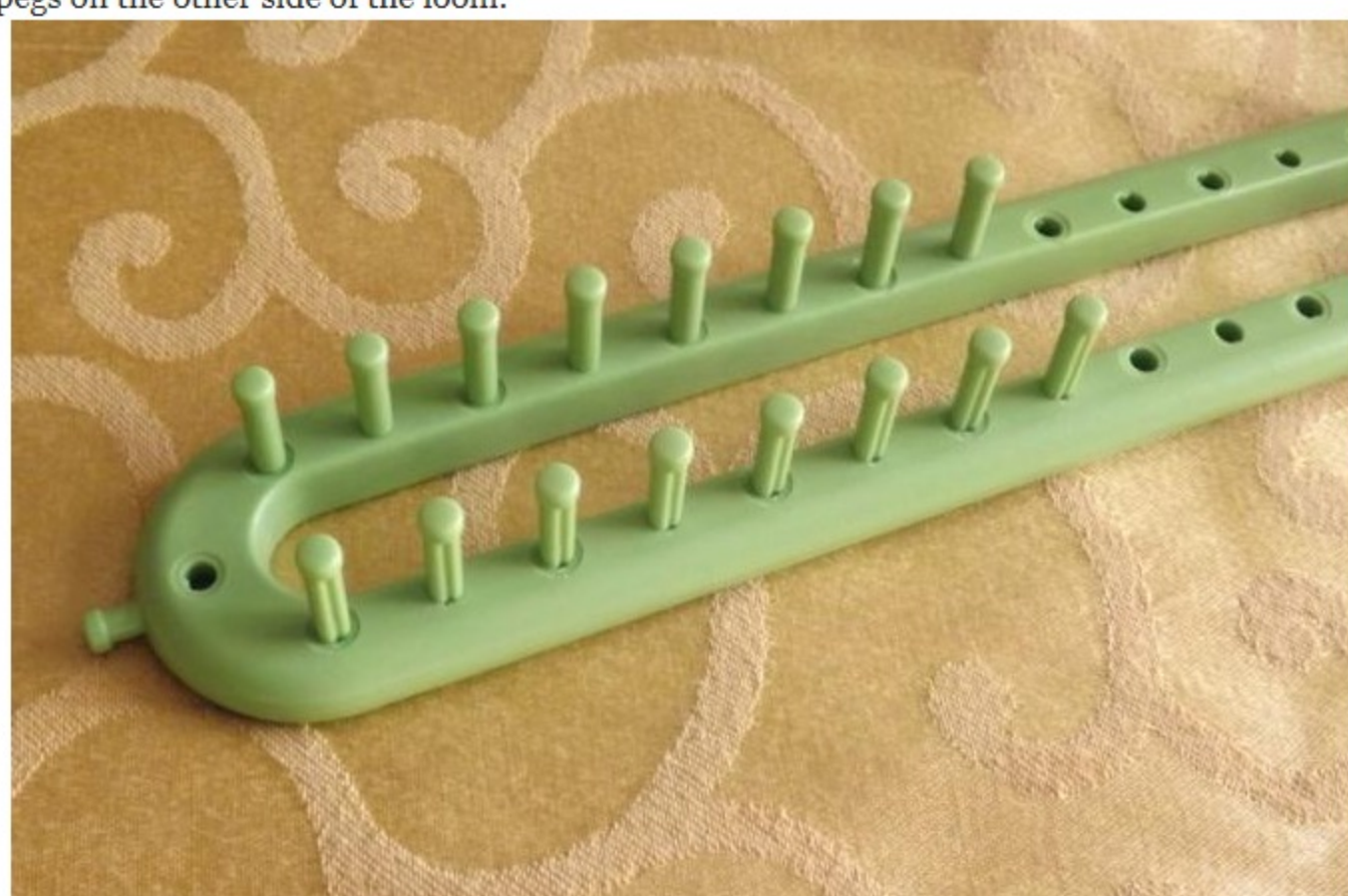
Prepare your loom.