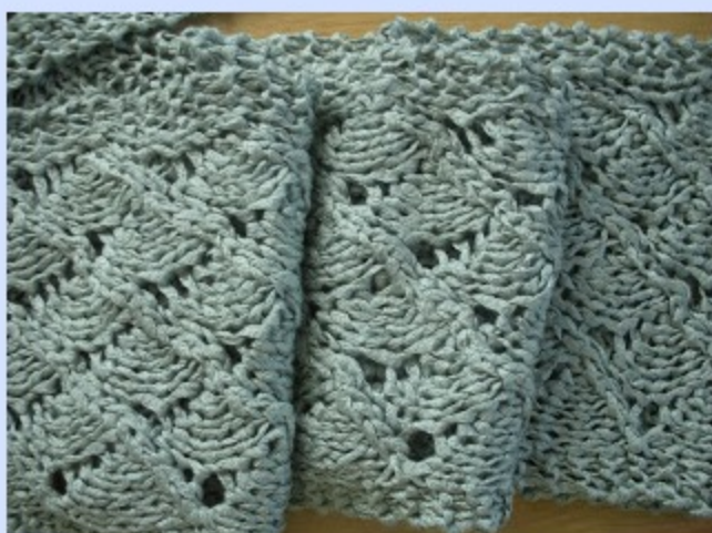
Milan Lace Scarf